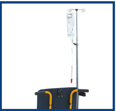
Left / Right adaptor for IV pole