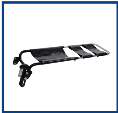
Plaster cast support