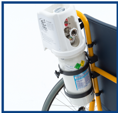
Oxygen cylinder holder