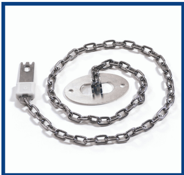
Wallplate with starting chain