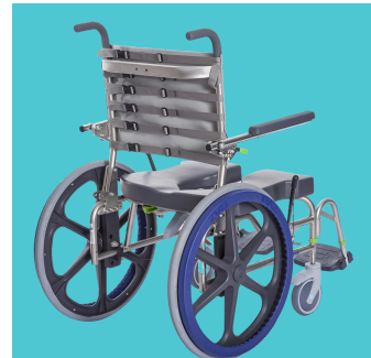
AP & SP