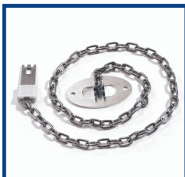
Wallplate with starting chain