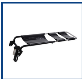
Plaster cast support