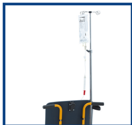
Left / Right adaptor for IV pole