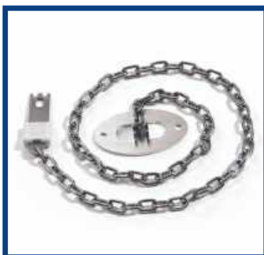
Wallplate with starting chain