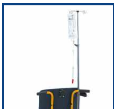
Left / Right adaptor for IV pole