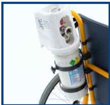
Oxygen cylinder holder