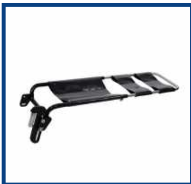
Plaster cast support