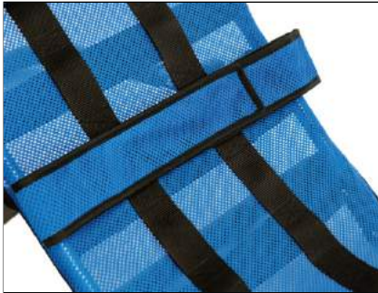
Trunk support maintains a safe position.