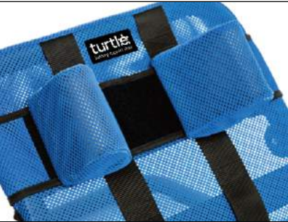
Adjustable head support help with positioning.