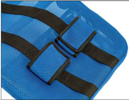
Lower limb support promotes stability and comfort