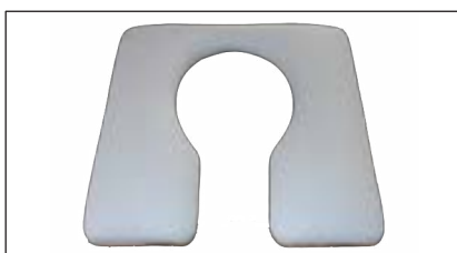
Longer Seat with Horseshoe