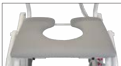
Seat with Reversed Opening