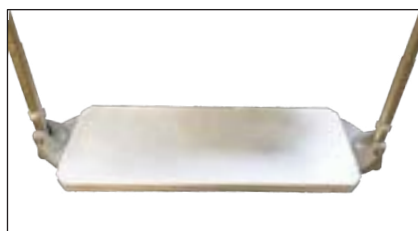
Full Footplate Neoprene