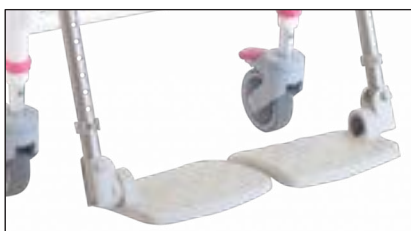
Height and Angle Adjustable Footrest