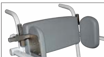
Lateral Support Right and Left