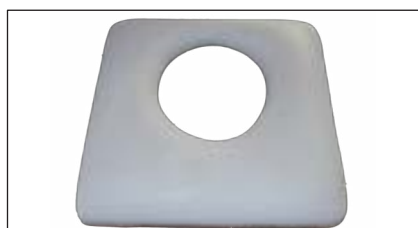
Longer Seat with Aperture