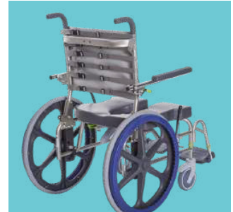
AP & SP